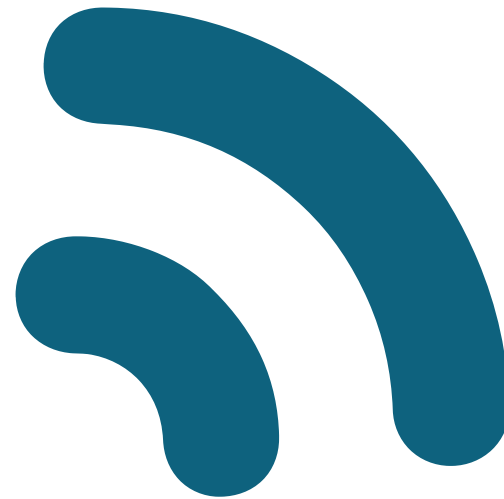
RADIUS ELEMENT MARINE